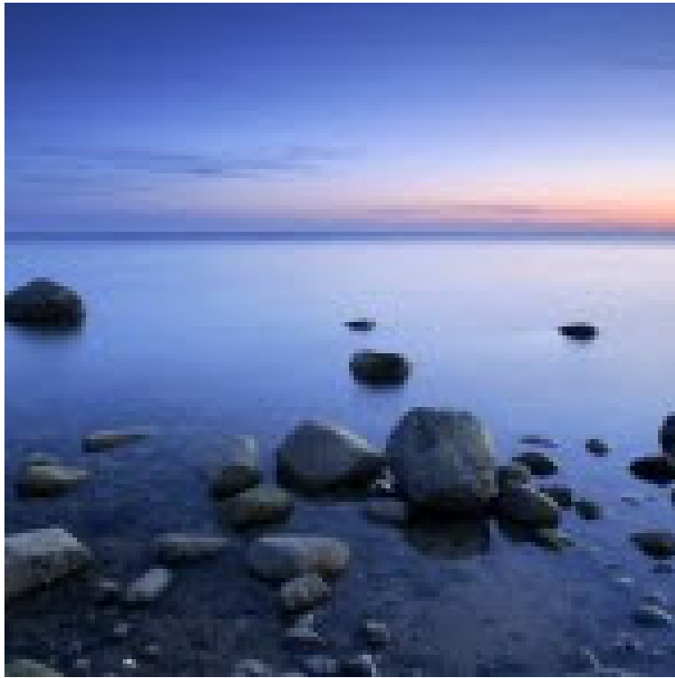
Create calm in your hypnotherapy practice

the pressure to perform 'tricks' in every session