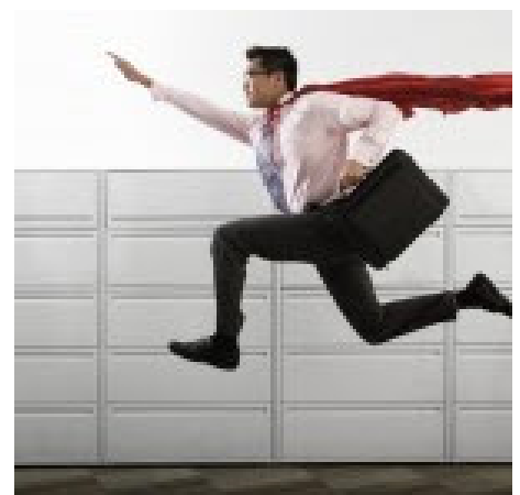
Are you a heroic therapist?

In my opinion, knowing how to do all this, to be authentic etc. whatever your therapeutic leaning, is absolutely central to being a therapist. And yet, many hypnotherapists never get this opportunity to develop. Cast off from their schools of hypnotherapy, hypnotherapists find themselves affiliated to the professional association of the school they trained with, perhaps even perpetuating the school's own blocks and misunderstandings among their peers. Let's face it, we came into this profession to treat people and earn a living at it, not to uphold a brittle and inflexible professional ethos that places a block between you and your clients. Growing up in this profession and becoming a fully endowed hypnotherapist requires you to make your own path while broadly working within some general ethical guidelines.